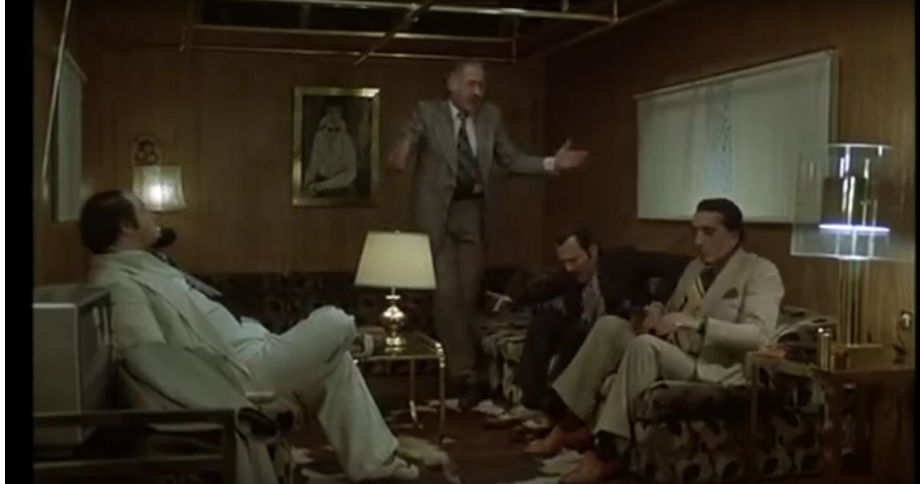
Fig. 2. The trailer. For your estimate assume one half of the trailer is seen on the picture.