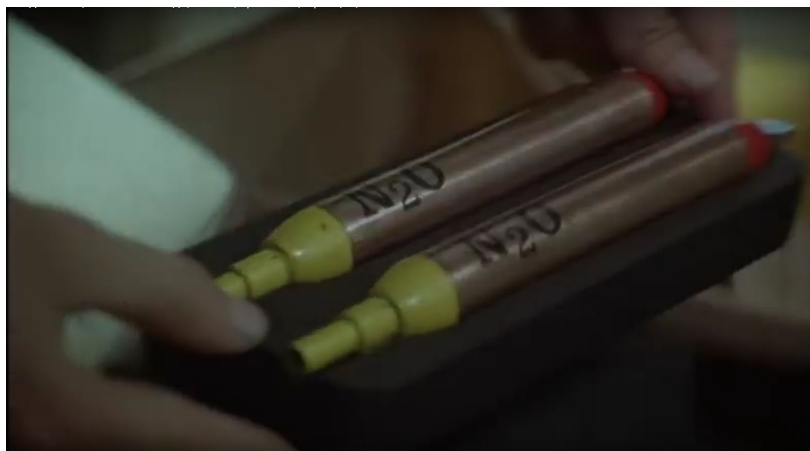
Fig. 1. The cylinders.

If, according to your estimate, the amount of N_2O is too small or too big, how many cylinders of that size should the hero have used to achieve a desirable result?